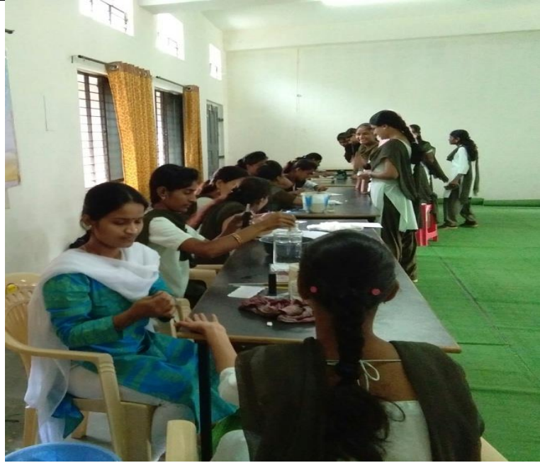
B.Sc S.Y.& T.Y. Girl students checking blood group of girl students in college