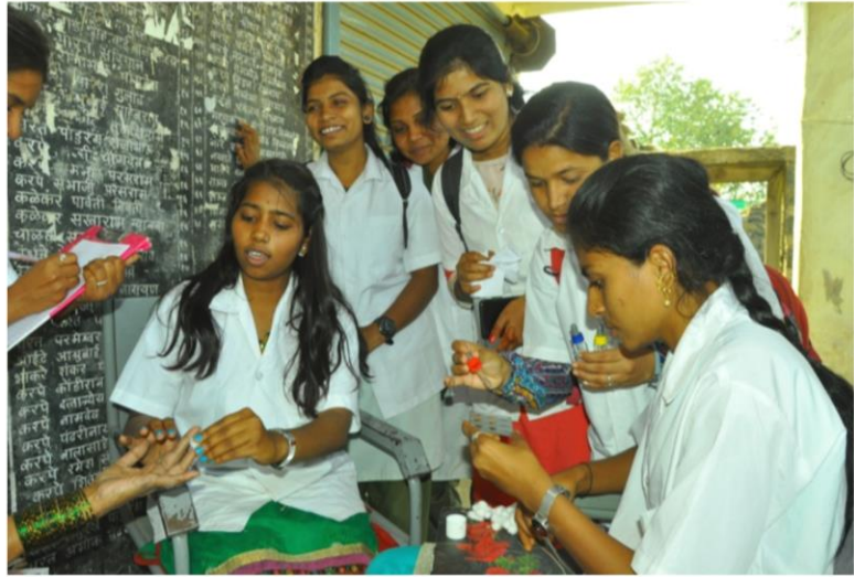
Students checking Blood Group & Hb of villagers