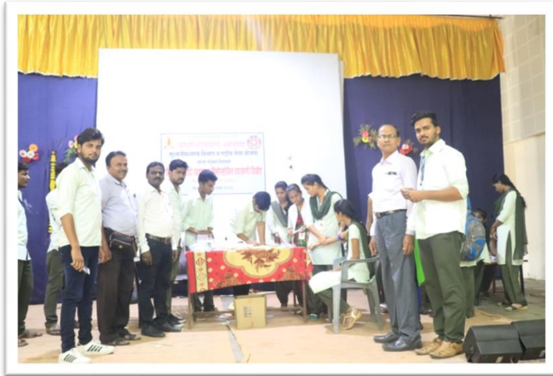
Students checking blood group & Hb of girl students