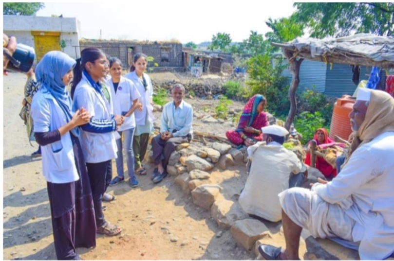
Students counselling villagers to check their blood group & Hb Students checking blood group & Hb of villagers