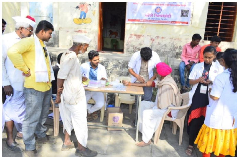
Students checking blood group & Hb of villagers