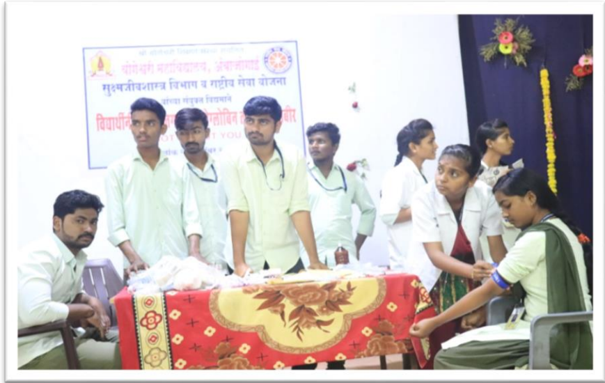
Students checking blood group & Hb of girl students