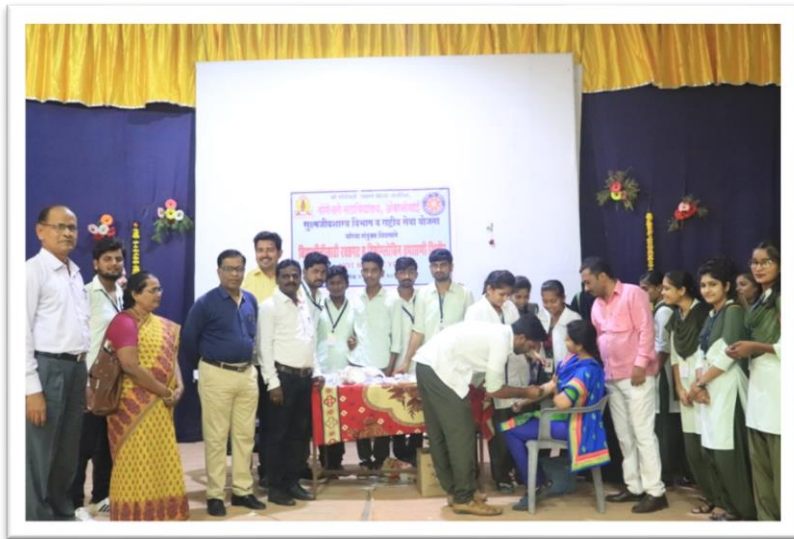
Students checking blood group & Hb of woman staff