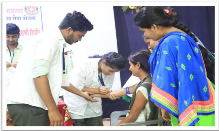
Students checking blood group & Hb of girl students