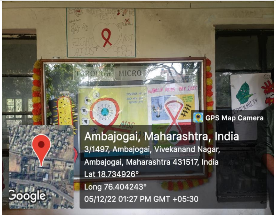
Wall Magazine displayed on HIV AIDS on World AIDS Day 2022