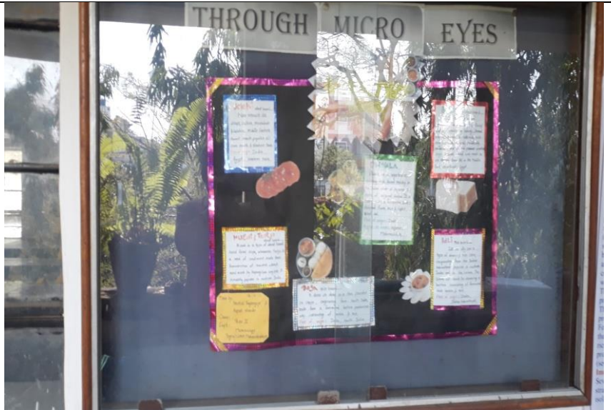
Students displayed Wall Magazine on Fermented Foods