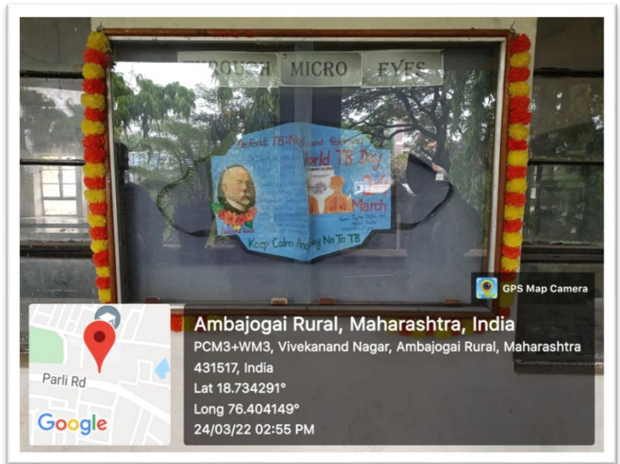
Wall Magazine Displayed by students on TB Day- 2022