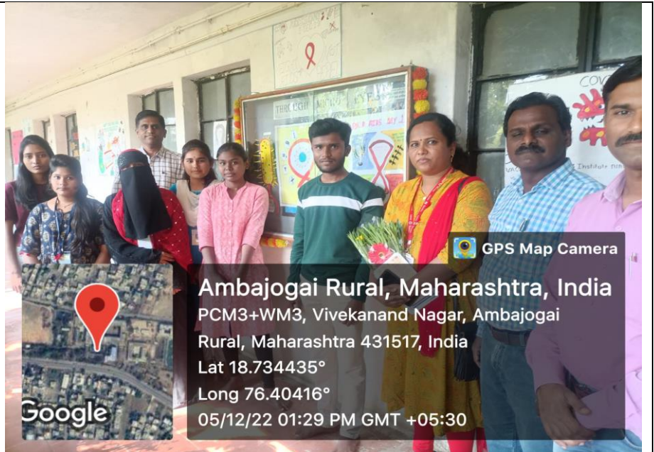
Students participation in Wall Magazine on HIV AIDS